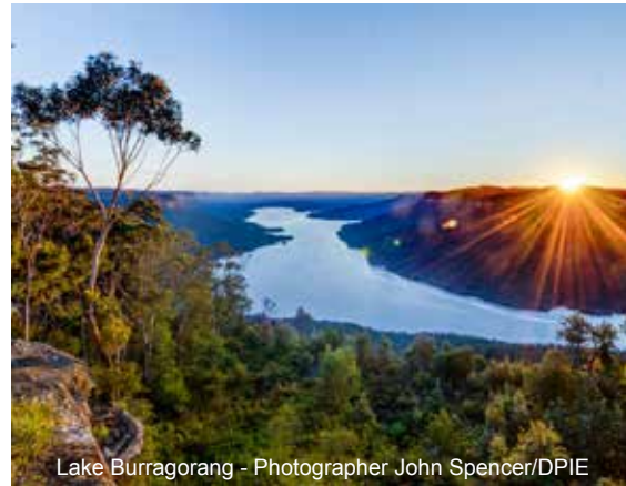
Lake Burraborang