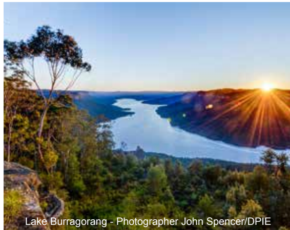
Lake Burratorang