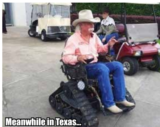
Meanwhile in Texas...

For over 30 years, AIDA Care has been assisting Australians in the Hospital, Residential Aged-Care, Home & Community Care, and Rehabilitation sectors. Come and see their new outlet at Sylvania, enjoy a coffee at Sylvania Shopping Centre beforehand and then lunch afterwards.